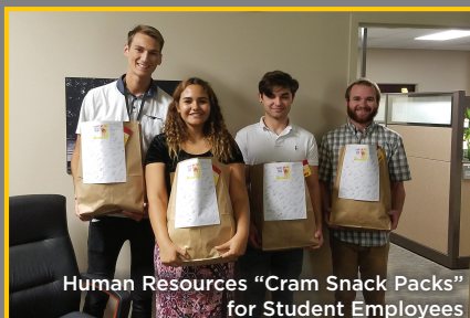
Human Resources "Cram Snack Packs" for Student Employees