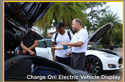
Charge On! Electric Vehicle Display