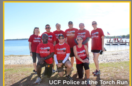
UCF Police at the Torch Run