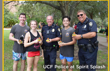
UCF Police at Spirit Splash