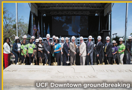
UCF Downtown groundbreaking