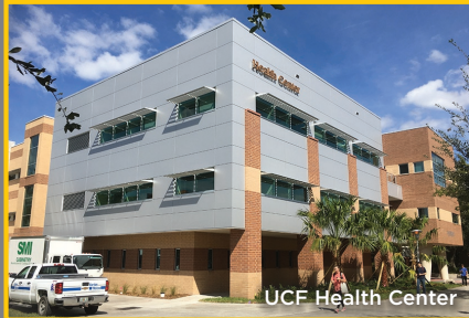
UCF Health Center