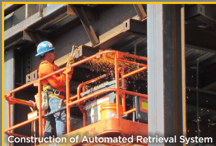
Construction of Automated Retrieval System