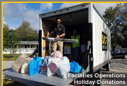
Facilities Operations Holiday Donations