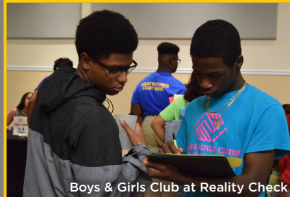
Boys & Girls Club at Reality Check