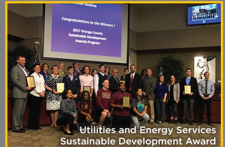
Utilities and Energy Services Sustainable Development Award