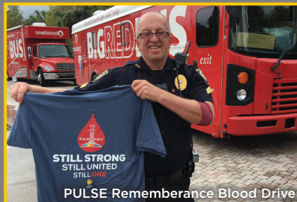
PULSE Remembrance Blood Drive