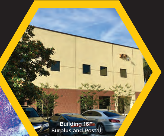
Building 16F Surplus and Postal