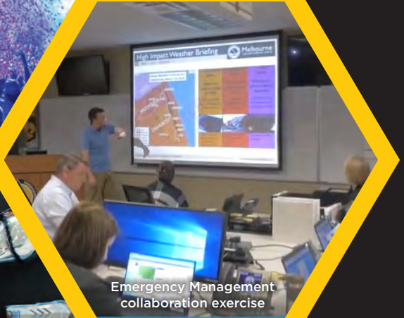
Emergency Management collaboration exercise