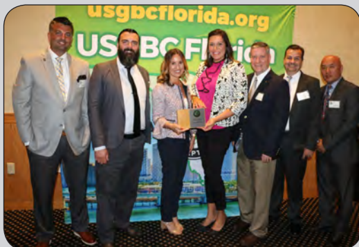
LEED Project and Green Hero Awards

Resource Management was one of 24 state agencies to receive a Prudential Productivity Cash Award 2018 from Florida TaxWatch for redesigning the university surplus program.