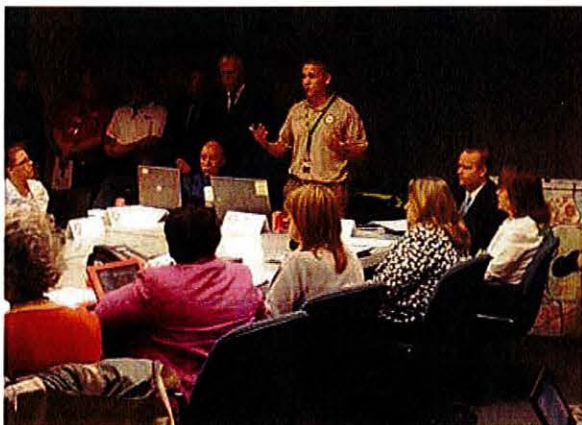
Emergency Management Training