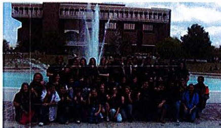
Business Services hosting AVID Students visiting campus