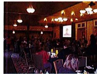
Administration and Finance administered the workplace giving campaign for the university