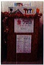
Administration and Finance hosted a campus-wide holiday gift collection for child victims of domestic violence

Business Services contributed monetary sponsorship and supplies to the UCF Book Festival, Alumni Association, Orientation, UCF Film Department, Veteran's Affairs, the Employee Recognition Program, Knights Helping Knights, Dance Marathon, FSECC, the Red Cross, domestic violence organizations, and local elementary schools.