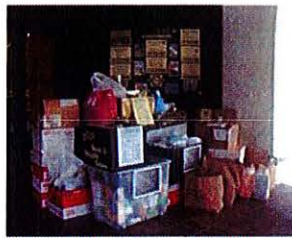
Administration and Finance hosted a critical needs drive to support the Coalition for the Homeless