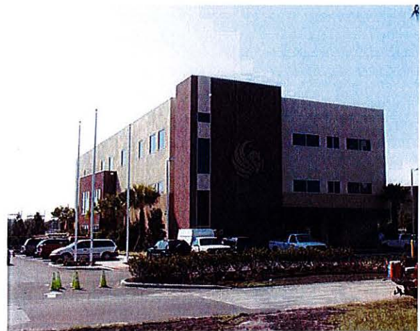
Police and Safety Building