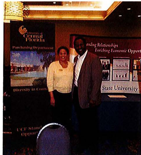
Supplier Diversity Day