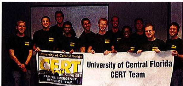
Emergency Management partnered with the American Red Cross to train UCF's first CERT Team.