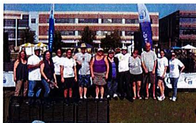
Finance & Accounting Relay for Life Team