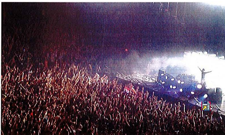
Tiesto Concert, UCF Arena