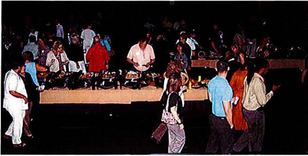
Human Resources hosted the Employee Awards Program