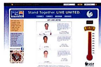
Business Services Designed the new UCF United Way Web site