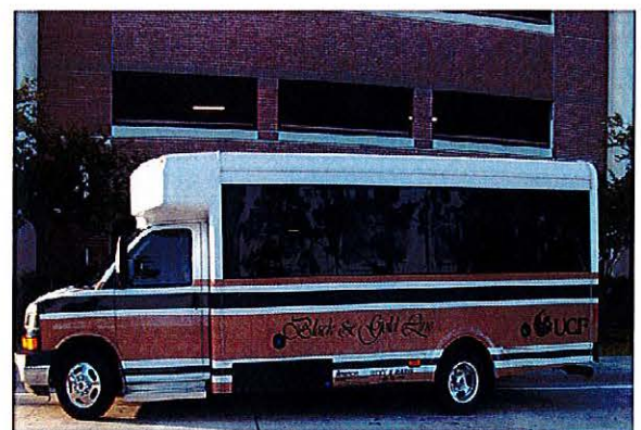
Parking & Transportation Services acquired several smaller shuttles for maneuverability in our parking lots.