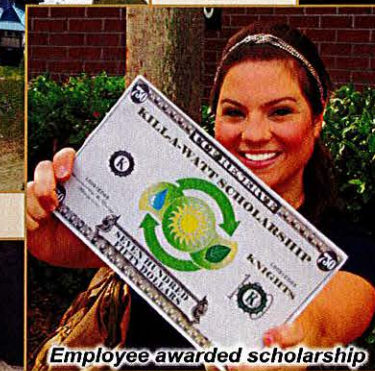
Employee awarded scholarship