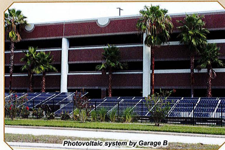
Photovoltaic system by Garage B