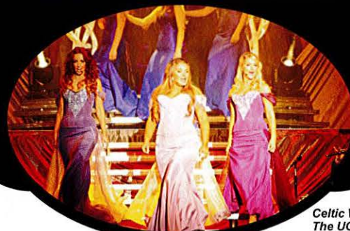
Celtic Woman at The UCF Arena