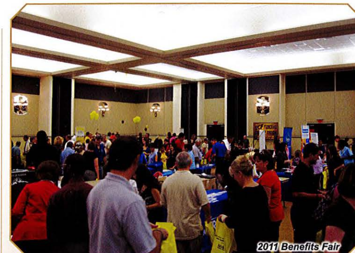
2011 Benefits Fair

Environmental Health and Safety offered training in Spanish for fire safety, fire extinguishers, and automated external defibrillators.