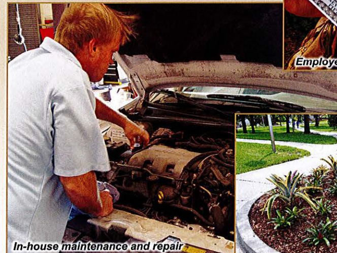
In-house maintenance and repair