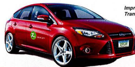
Improving Campus Transportation