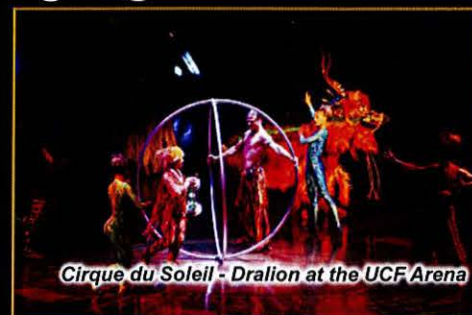
Cirque du Soleil - Dralion at the UCF Arena